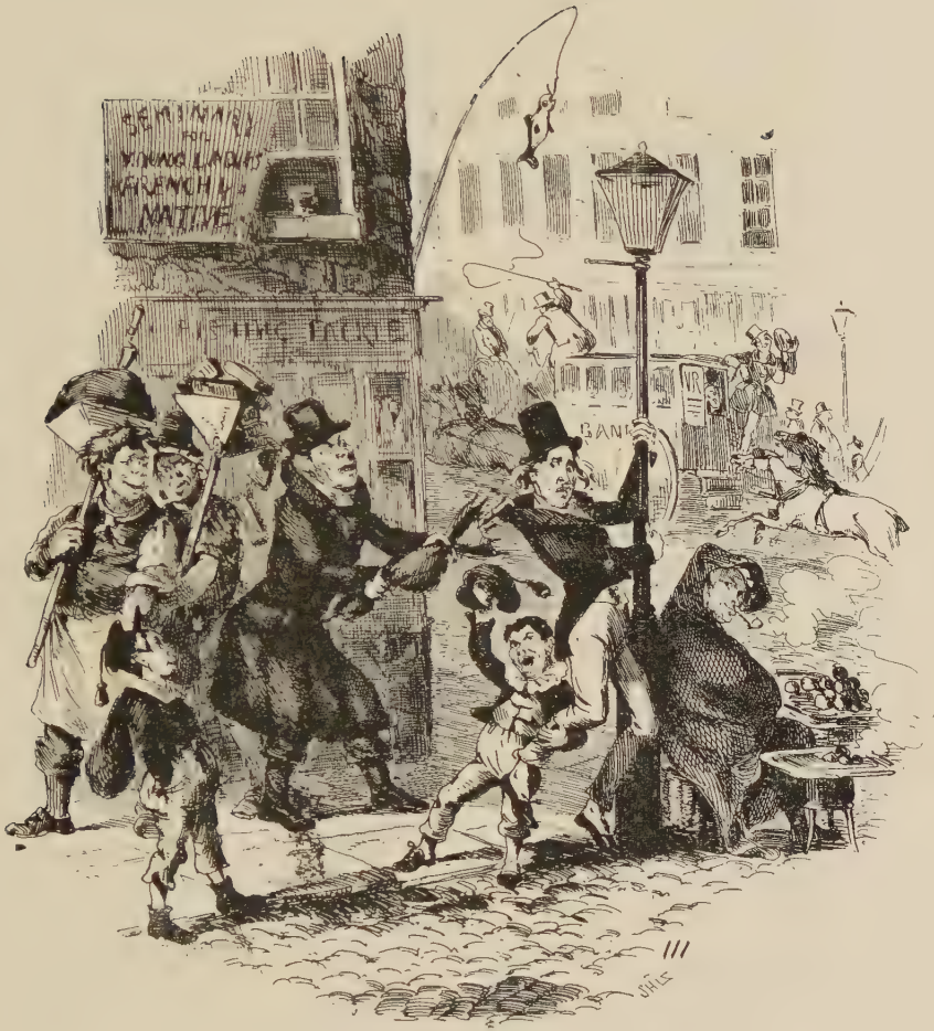
A SUDDEN RECOGNITION UNEXPECTED ON BOTH SIDES.